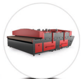
Industrial Fixation Unit Not included with printer