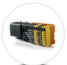
PLC Technology German Electronics